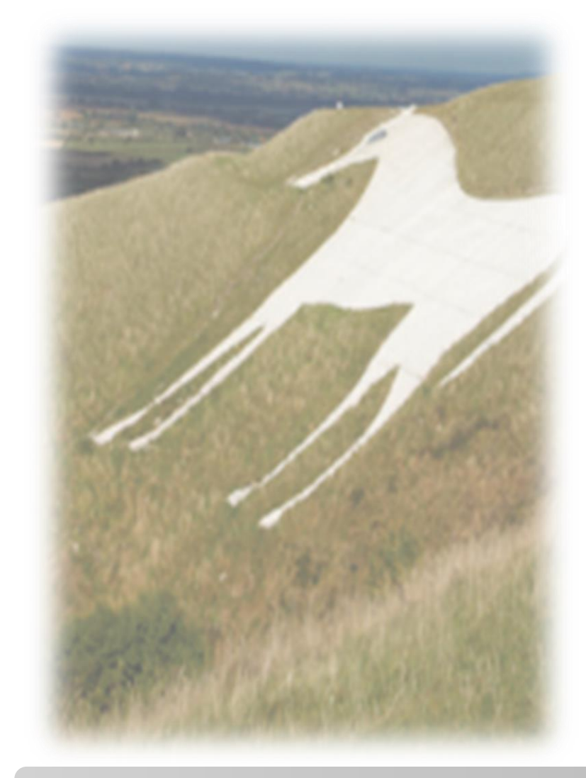
Socially Responsible Procurement Policy Wiltshire Council